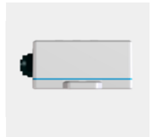
LT-500 side view