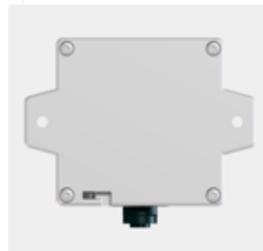
LT-500 bottom view