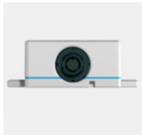
LT-500 connector view