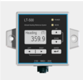
LT-500 front view